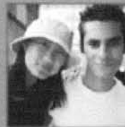
TEENS © 2006