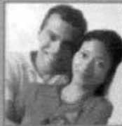
PARENTS © 2006