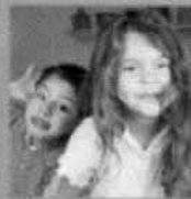
KIDS © 2006